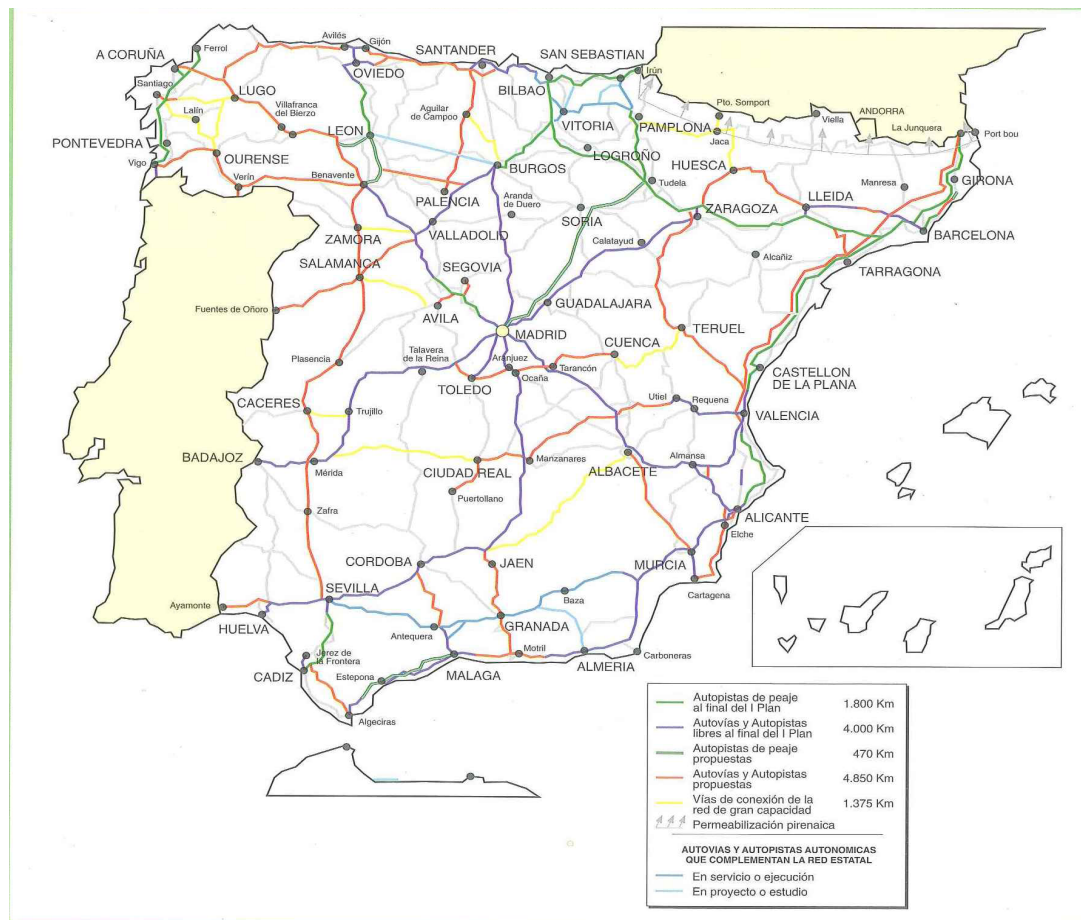
Figure 4. The Infrastructure Master Plan – “Director de Infraestructuras” (PDI): 1993-2007

Source: MOPT (1994). Notes: Light green: toll motorways in service at the end of the previous National Road Plan; dark blue: free motorways in service at the end of the previous National Road Plan; dark green: national toll motorways planned; red: national free motorways planned; yellow: connections between high-capacity roads; mid-blue: regional motorways in service at the end of the previous National Road Plan, light blue: planned regional motorways.