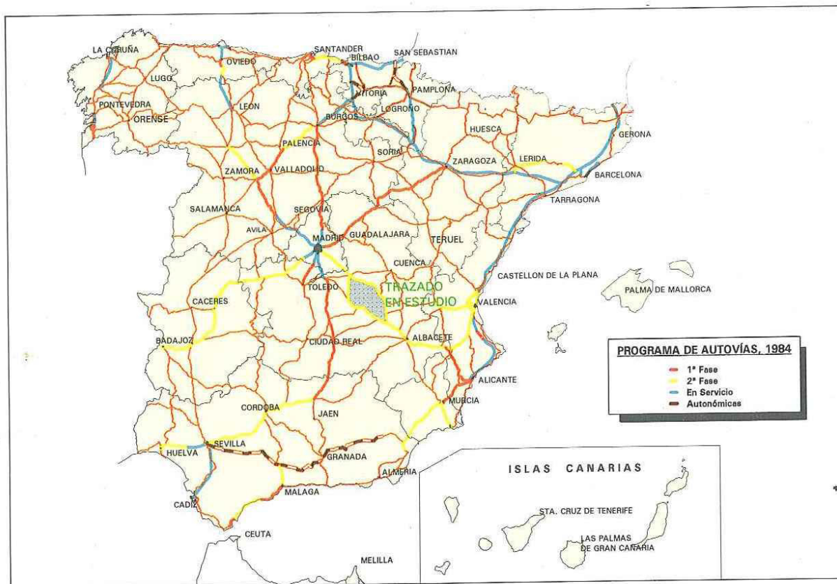
Figure 2. The National Road Plan – “Plan General de Carreteras” 1984-1991

Source: MOPT (1993): Note: bold red lines are free motorways that were planned to be constructed in the first phase of the programme; bold yellow lines are free motorways that were planned to be constructed in the second phase of the programme; blue bold lines are motorways that were in service; black-red bold lines are motorways that were to be built by the regional governments.